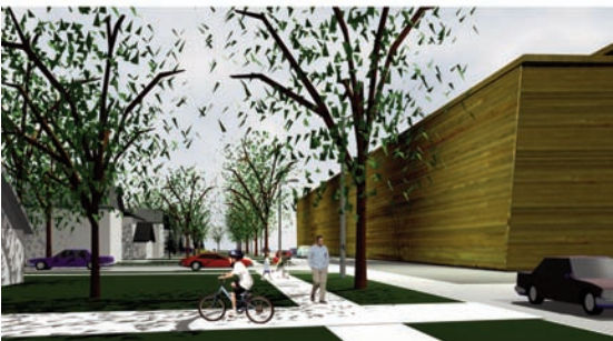
(These Drawings Not to Scale)