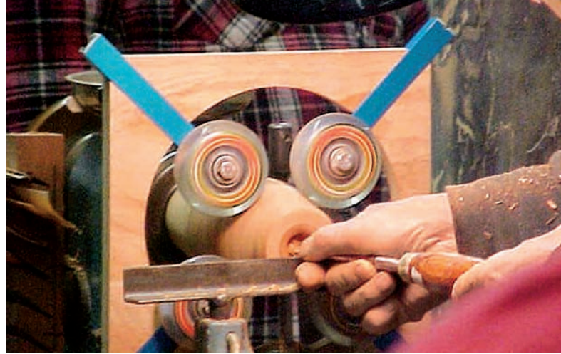
The steady rest allows a vase to be chucked and comfortably supported while the inside of the neck is being shaped.

The diagonal dadoes in the jig are milled to accept standard T-track. To install it, begin by drilling a 5/16" hole in each dado, centering it both side-to-side and along the length of the dado.