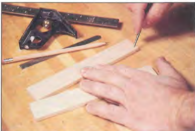
Photo A: Carefully lay out and mark the centerpoints for the brass pin holes on the face of one fixed and one movable side piece.

Step 1. From \frac{1}{16} " brass rod, cut eight 1" lengths. File the ends so they