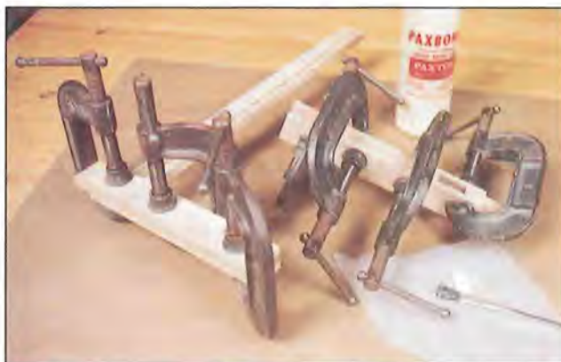
Photo C: Glue and assemble the fixed and movable jaws, then drive brass alignment pins and clamp.