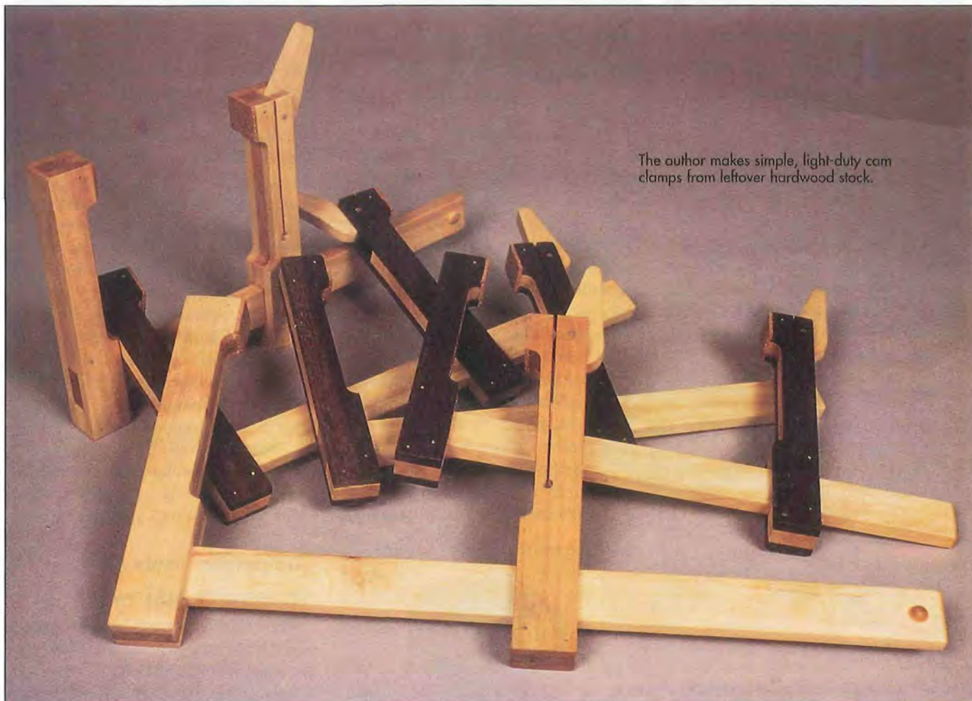
The author makes simple, light-duty cam clamps from leftover hardwood stock.

I often face the dilemma of not having enough clamps for the project. On the other hand, equipping a shop with clamps, as you've probably noticed, can be a budget buster. To balance my needs and my available woodworking funds, I tried a couple of new approaches. First, I began planning the assembly phases of my projects to work around my limited clamp supply. Second, I started making my own clamps from leftover materials I had in the shop.